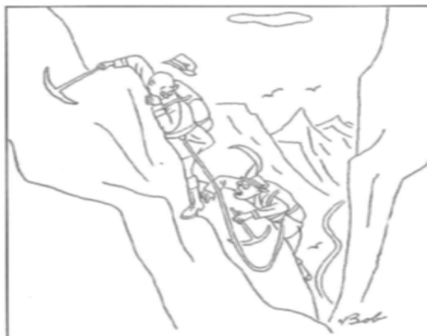
"This is the damn'dest Twelfth Step call I've ever been on!"

I am Responsible. When anyone, anywhere reaches out for help, I want the hand of AA always to be there, and for that I am responsible!